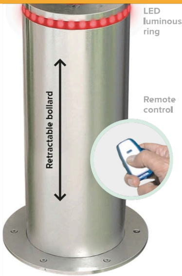
LED luminous ring